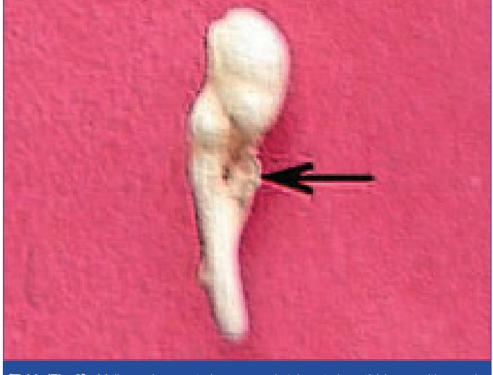
[Table/Fig-3]: Malleus whose anterior process is 'almost absent' (shown with arrow).