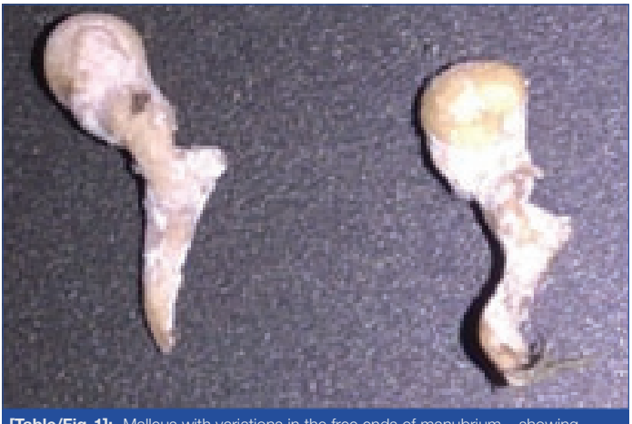
[Table/Fig-1]: Malleus with variations in the free ends of manubrium – showing straight and curved handle.